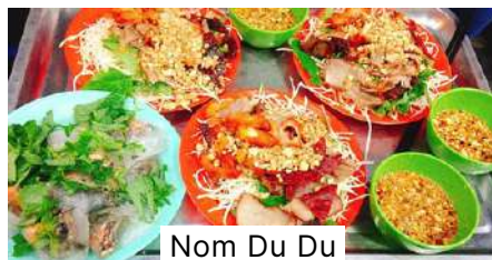
Nom Du Du